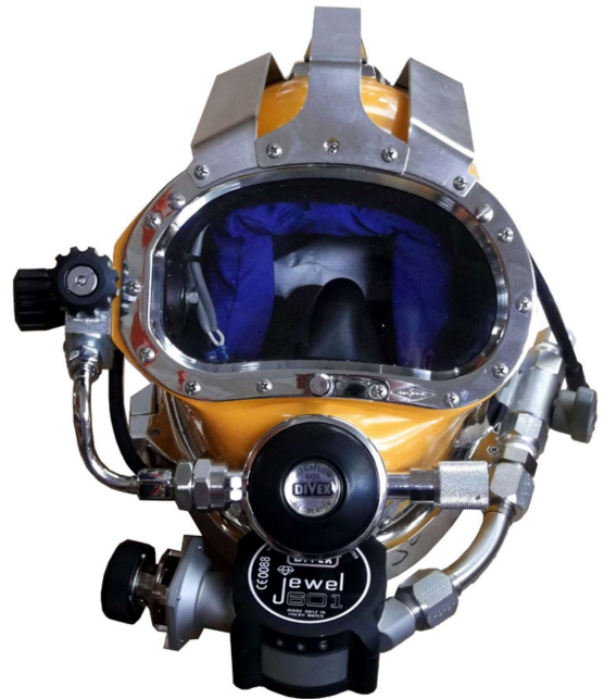
JFD/Divex Ultrajewel 601

All other breathing systems on the market ARE NOT APPROVED to be used with Kirby Morgan helmets and BandMask®.